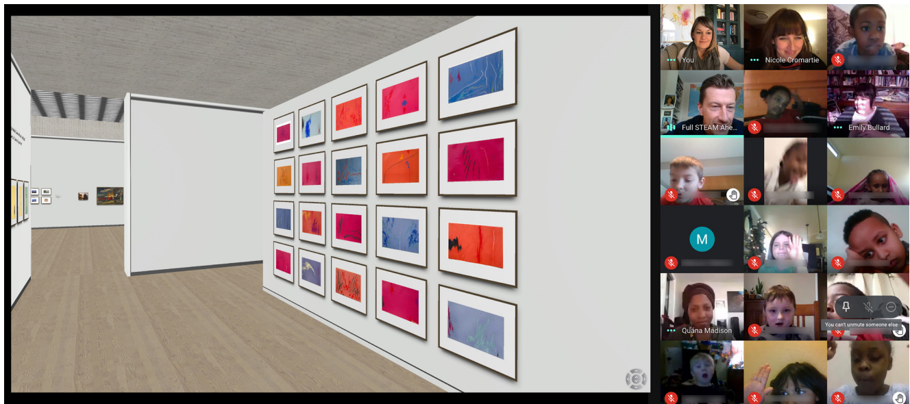
Fig. 5. First-grade co-curators at Montclair School of Academics and Enrichment select and arrange Clyfford Still's pastels on construction paper into a pattern for display in Young Mind during a Zoom session with Cromartie and Placzek.

Guided by CSM staff, young children participated in the exhibition's development in many ways. For instance, infants in three different classrooms at two schools selected the paintings featured in our high contrast-themed gallery. We identified their selections by tracking and tallying various preference indicators, such as pointing, vocalizing, grabbing, and extended eye contact (fig. 3). To develop an interactive experience in our gallery devoted to pattern, we observed how three- to five-year-olds from a different school interacted with predetermined materials and provocations (an open-ended activity) (fig. 4). For that same gallery, five- and six-year-olds from a local elementary school virtually "placed" drawings previously selected by three- and four-year-olds into a pattern arrangement on the gallery wall using our web-based virtual planning software, Virtual Gallerie (fig. 5).