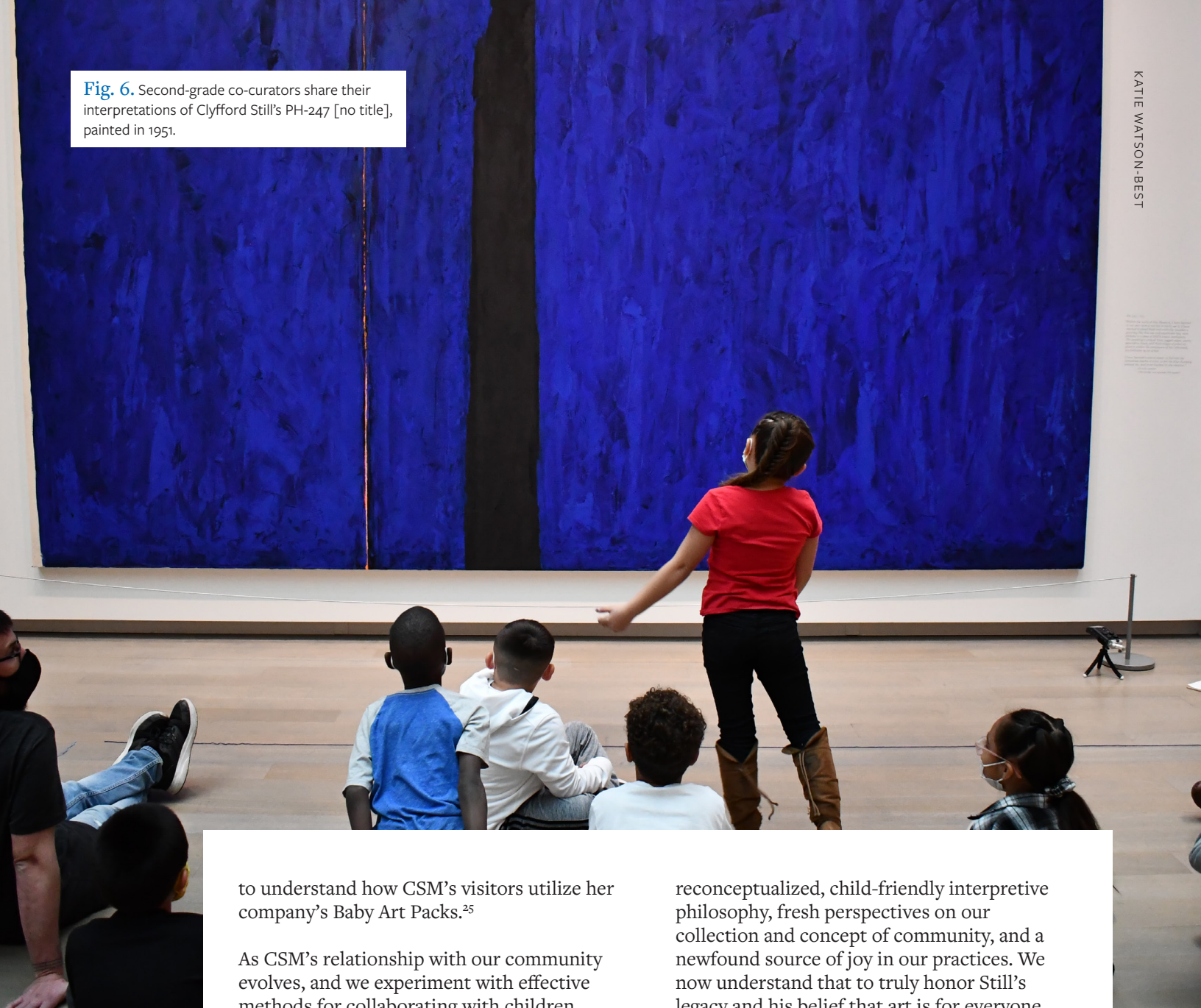
Fig. 6. Second-grade co-curators share their interpretations of Clyfford Still's PH-247 [no title], painted in 1951.

to understand how CSM's visitors utilize her company's Baby Art Packs. 25