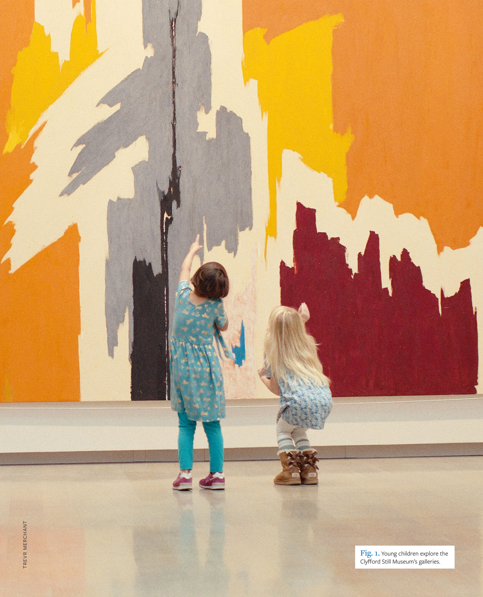
Fig. 1. Young children explore the Clyfford Still Museum's galleries.