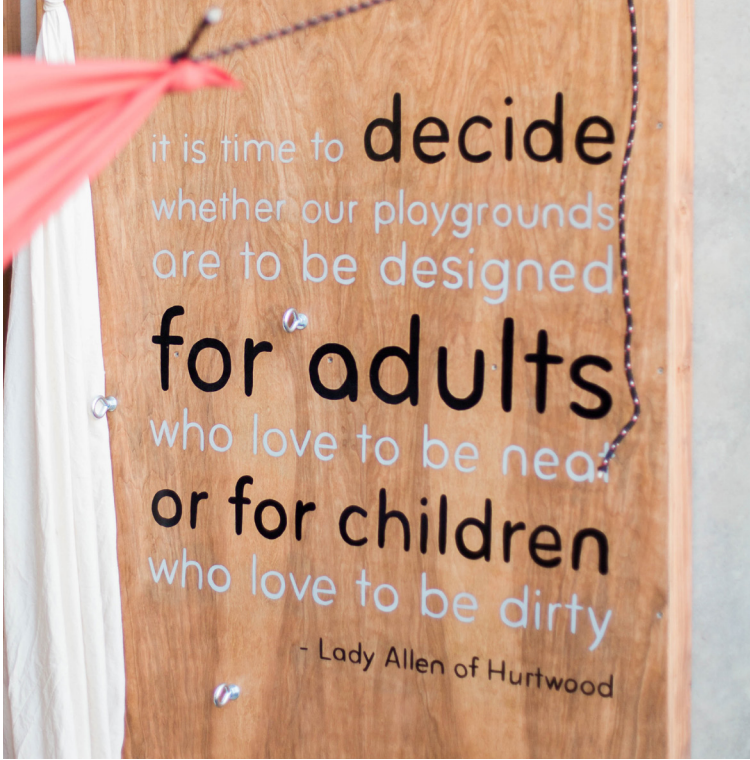
Fig. 2. A quote from Lady Allen of Hurtwood on a wall in MAKE/SHIFT , an indoor adventure playground that playworkers and I co-created at The New Children's Museum.

playground possible – as well as some shifts in thinking that have made my work in exhibit design more playful and expansive. As we emerge from the crises of 2020 and beyond (COVID-19 pandemic, global reckoning focused on racial justice), adopting a playwork approach to children's exhibit design and development could have significant impact on how we create more equitable and playable spaces for children – and, even, for those of us who once were.