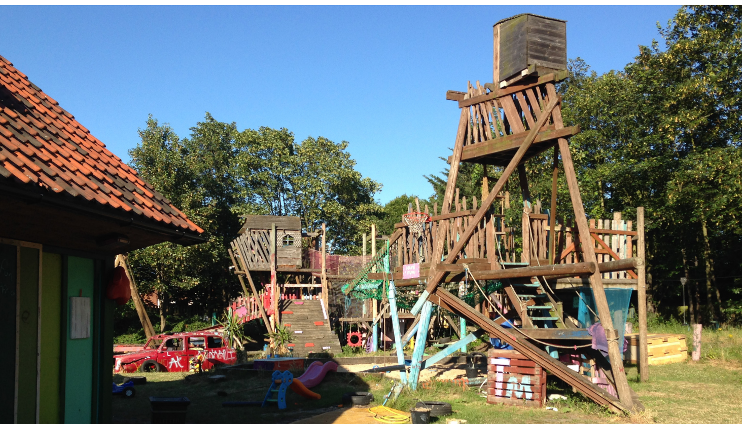
Fig. 4. This red taxicab, rust and all, was once affixed to the top of the wood structure behind it at Homerton Grove Adventure Playground. After years of use, the cab was brought down by playworkers, whose shadows are in the foreground. On the day of the author's visit, children danced on the top of the cab, while a playworker recorded a "music video" to say goodbye to the beloved plaything.