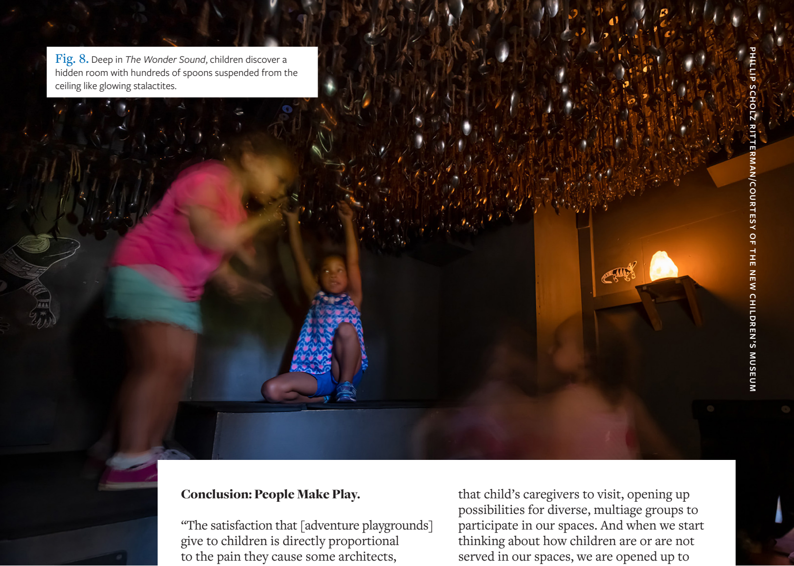
Fig. 8. Deep in The Wonder Sound , children discover a hidden room with hundreds of spoons suspended from the ceiling like glowing stalactites.