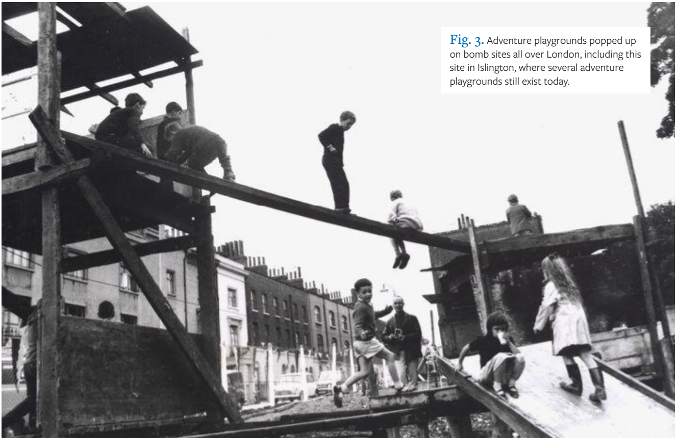
Fig. 3. Adventure playgrounds popped up on bomb sites all over London, including this site in Islington, where several adventure playgrounds still exist today.