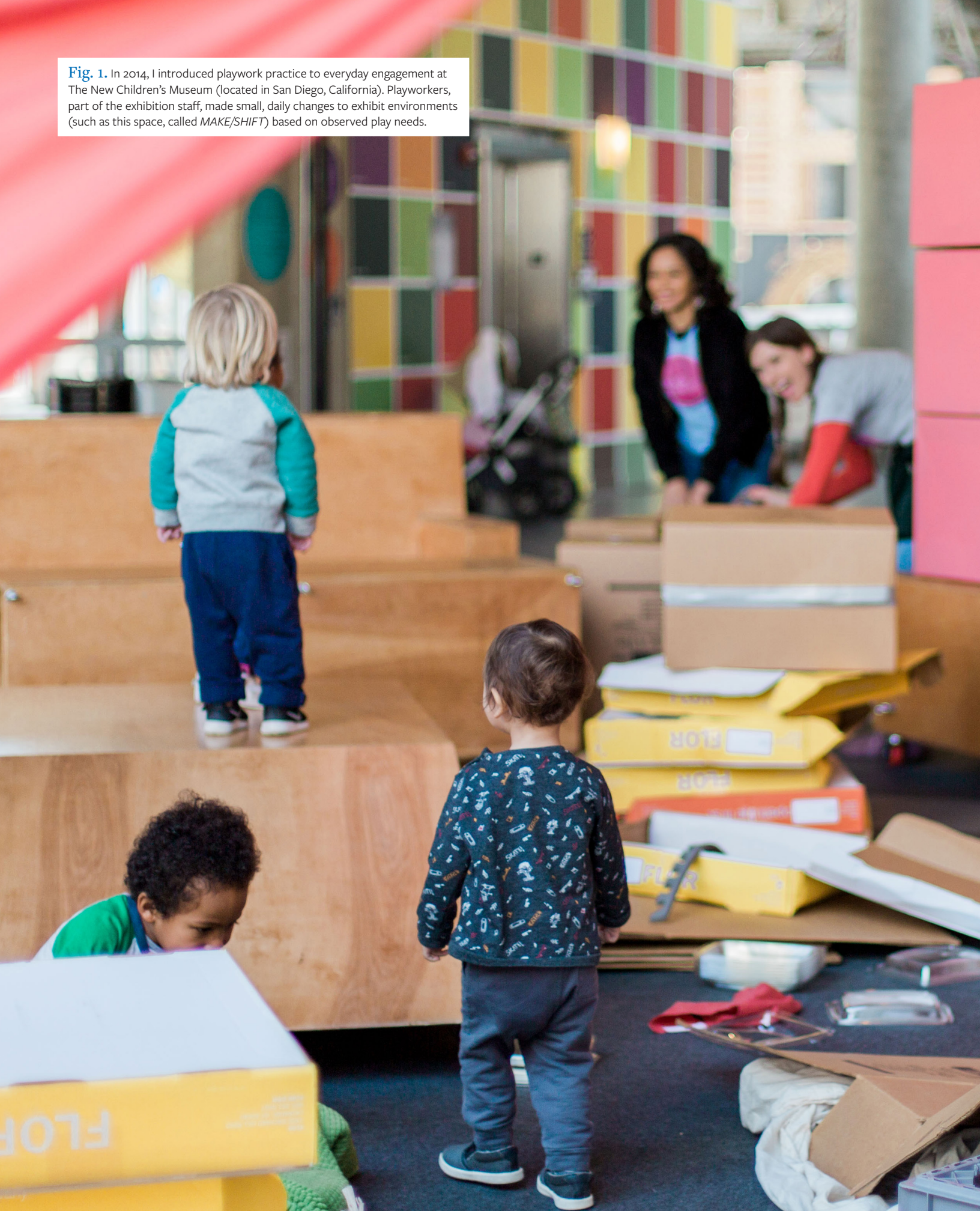
Fig. 1. In 2014, I introduced playwork practice to everyday engagement at The New Children's Museum (located in San Diego, California). Playworkers, part of the exhibition staff, made small, daily changes to exhibit environments (such as this space, called MAKE/SHIFT ) based on observed play needs.