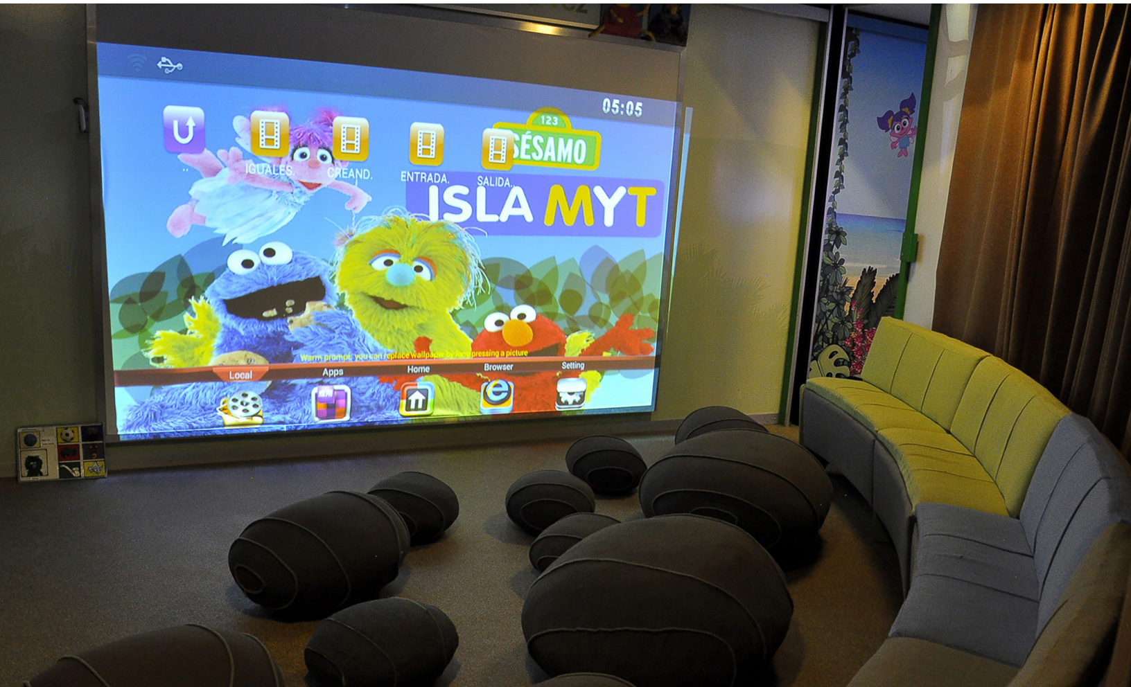
Fig. 4. View of the exhibit presenting the Sesame Street characters.