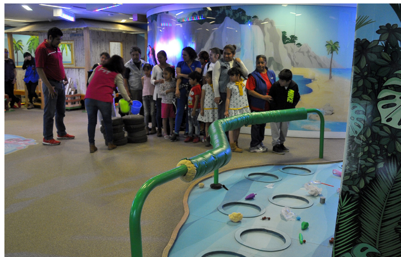
Fig. 6. A group of children and adults collaborating in an activity.