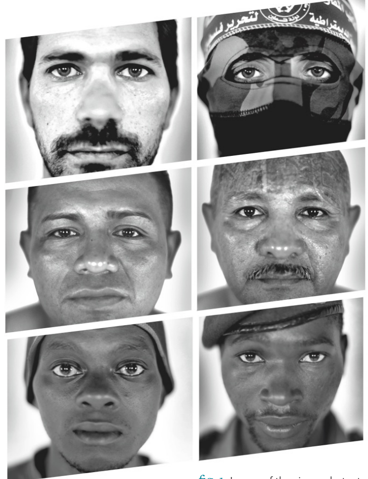
fig. 1. Image of the six combatants interviewed in The Enemy .

A visit to The Enemy is a unique experience for several reasons. The number of participants in each screening is limited to the available technology, but also by the intimacy of the encounter Ben Khelifa has sought to create. When I arrived at the Phi Centre for my timed entry, I was equipped with a VR headset which provided the audio and visual projection of the changing surroundings dedicated to each of three conflict zones, as well as a PC backpack computer, and I embarked with four others similarly outfitted on a 50-minute journey. I was surprised to be told that the entire screening would occur in a single physical room. Donning the headset and backpack, I soon learned that the VR element introduces a sequence of spaces and audio that would unfold in this one room and that defined the geographies of difference upon which the installation is premised: each pair of combatants occupies a different "locale" that I would enter into, circulate around, and then leave, as I physically moved from virtual space to virtual space and metaphorically traveled from geographic conflict to geographic conflict all within a modest room at Phi.