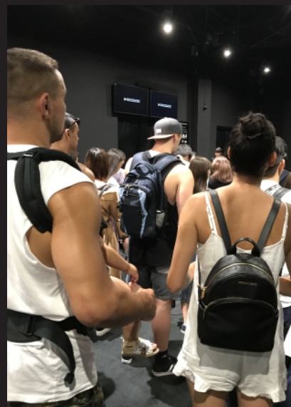
Fig. 6. Of its 2.3 million first-year visitors, half were foreigners and half of those said they came to Tokyo to see Borderless. The majority of visitors are young adults.