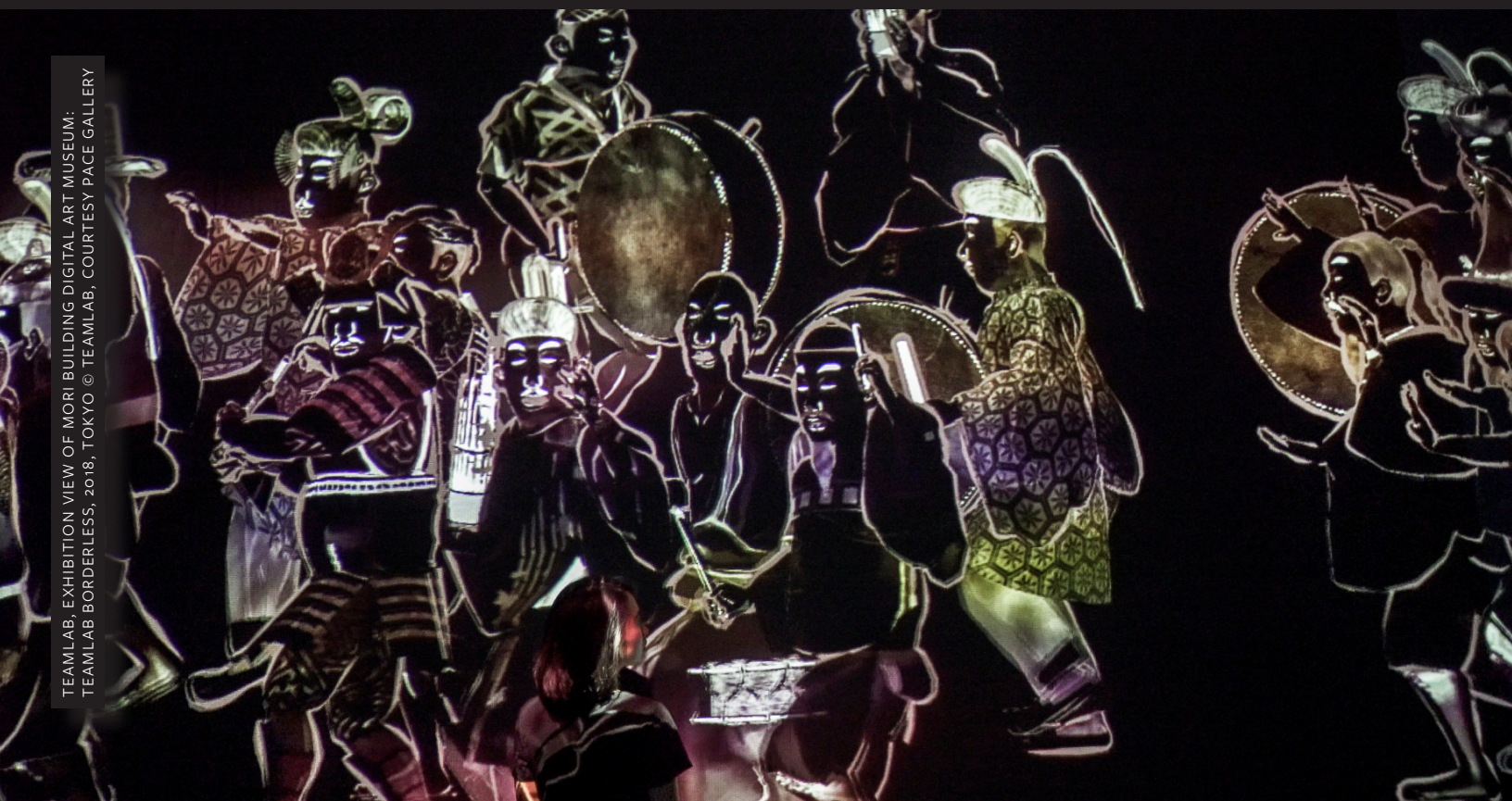
Fig. 2. Figures in Heian period (794 to 1185) dress march in procession while playing historical instruments or waving their arms in dance-like motions.

Traditional Japanese culture informs many exhibits. The most compelling, even hypnotic, among them is Walk, Walk: Search, Deviate, Reunite (fig. 2).