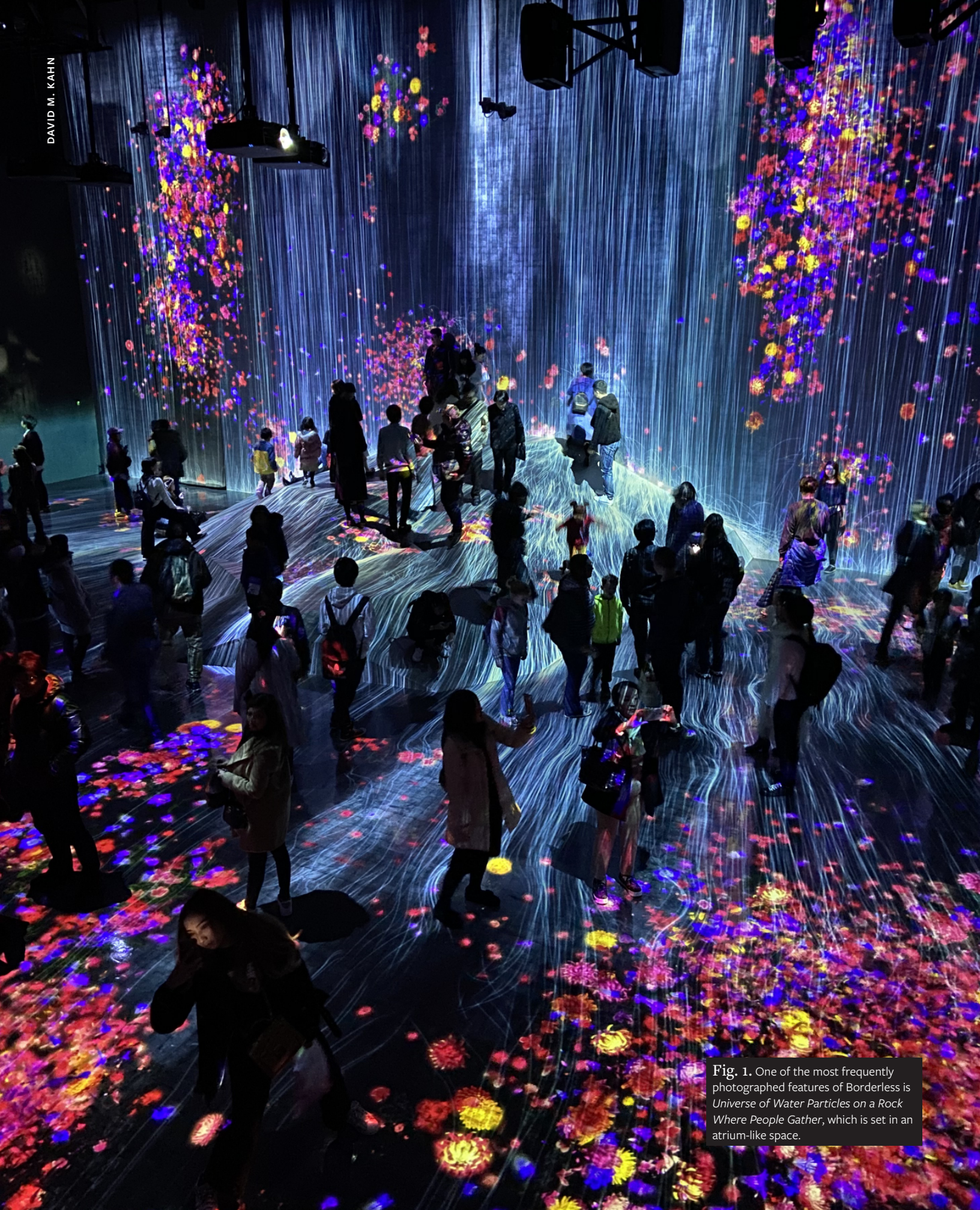
Fig. 1. One of the most frequently photographed features of Borderless Universe of Water Particles on a Rock Where People Gather , which is set in an atrium-like space.