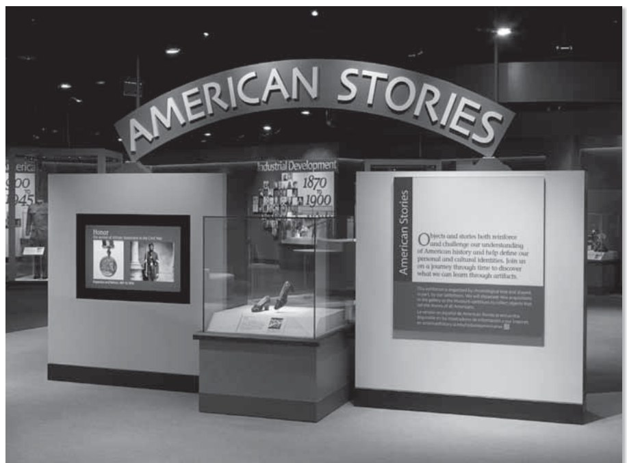
Introductory panel, American Stories. Rather than trying to sum up the content of the exhibition, the American Stories introductory panel is about “what we can learn from artifacts.” It locates objects as sources for understanding history and identity.